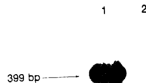
FIG. 2. Expression of CB1 transcripts detected by oligonucleotide hybridization of PCR-amplified products from cerebellum (lane 1) and RBL-2H3 cells (lane 2).

nabilone and \Delta^8 -THC displaced bound [ ^3 H]WIN 55,212-2 with IC_{50} values of 2.6 \pm 1.4 nM and 223 \pm 120 nM, respectively (Table 1). A nonpsychoactive cannabinoid, cannabidiol, failed to show concentration-dependent displacement activity up to 1 \mu M, in keeping with its weak affinity for cannabinoid receptors (18, 21).